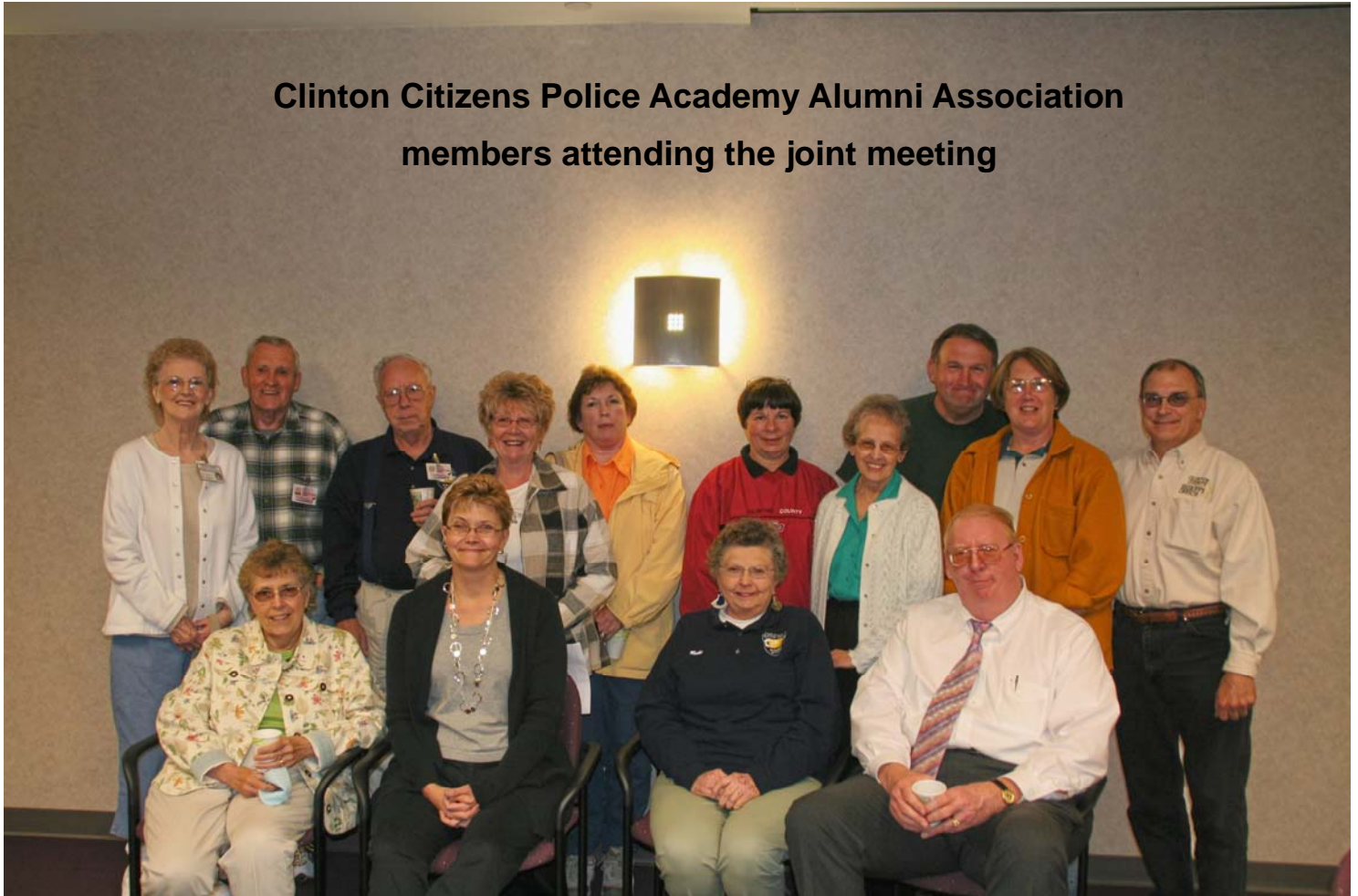
Clinton Citizens Police Academy Alumni Association members attending the joint meeting